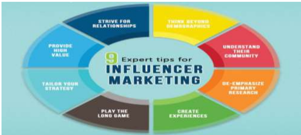
Figure 1: Social media influencer attributes

incorporation of sponsored content not only benefits the influencers financially but also allows them to maintain authenticity and credibility in the eyes of their followers, who appreciate transparency and value authentic recommendations. In conclusion, social media influencers have become a powerful force in the realm of social media marketing, leveraging their substantial following and engaged audience to influence consumer behavior and shape trends. Their presence and impact have transformed the way businesses approach marketing, leading to collaborative partnerships and the rise of sponsored content as a means of effective promotion. As social media continues to evolve, it is expected that influencers will continue to play a crucial role in shaping online conversations, disseminating information, and driving consumer engagement. Therefore, individuals and businesses alike need to recognize and harness the power of social media influencers to stay relevant and successful in this dynamic digital landscape. The attributes of social media influencers can be seen in Figure 1: